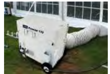
This type of portable heater is the safest and most efficient type of heater for large tents.